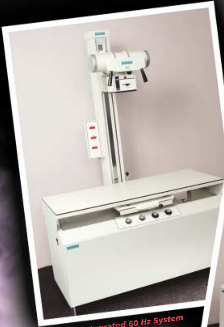
AV2 Integrated 60 Hz System